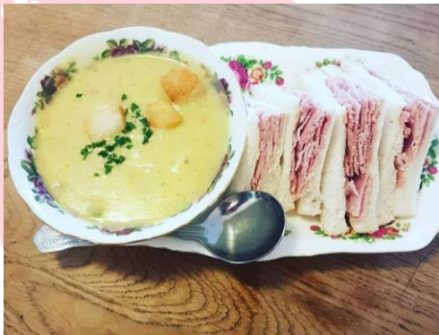
Our Delicious Homemade Soup and Sandwich

We pride ourselves on our Homemade and locally sourced food as well as the great service our customers come to expect from us. We strive to be the very best and be the number one place to visit in the area.