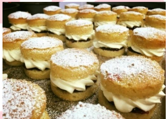
Mini Victoria Sponge Cakes (only available on our High Tea)